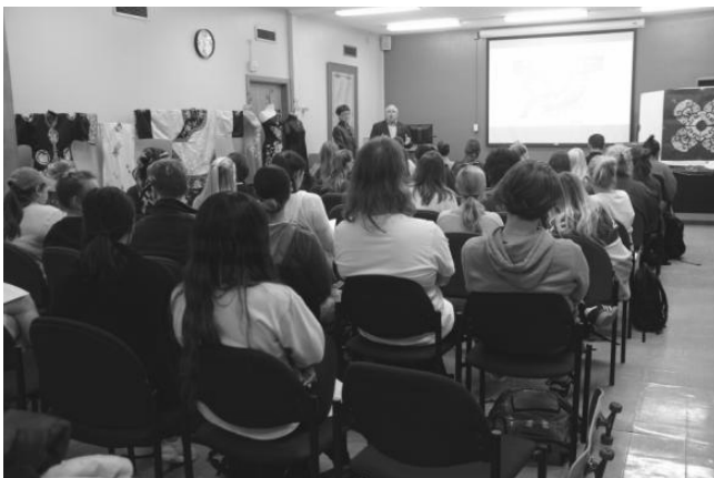
Figure 4. Academic lecture series about Chinese costume (The picture was taken in the U.S. in 2018).