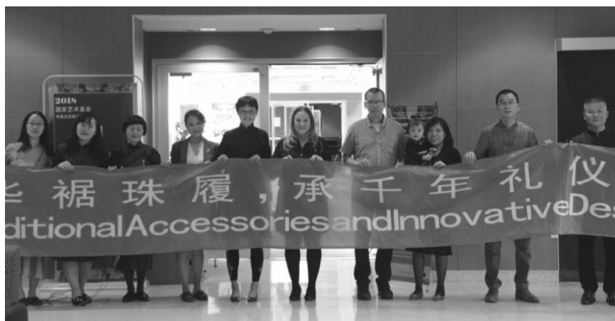
Figure 6. Picture of members of the overseas dissemination of Chinese costume culture (The picture was taken in the U.S. in 2018).

Finally, in order to effectively understand the recognition, acceptance and spread of traditional Chinese costume culture overseas, this article takes the communication site of the North Carolina State University Station as an example where a questionnaire survey of 127 local visitors was conducted. The survey uses the Likert 7 scale, which uses seven numbers “-3, -2, -1, 0, 1, 2, 3” to express the seven attitudes of “disagreement, comparative disagreement, general disagreement, neutrality, general agreement, comparative agreement and very agreement” for visitors to choose from. Ta-