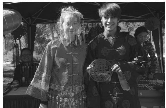
Figure 5. Americans dressed up in Chinese wedding costumes (The picture was taken in the U.S. in 2018).