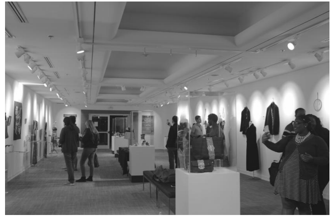
Figure 3. Real static display about ancient Chinese costume fabrics and crafts (The picture was taken in the U.S. in 2018).